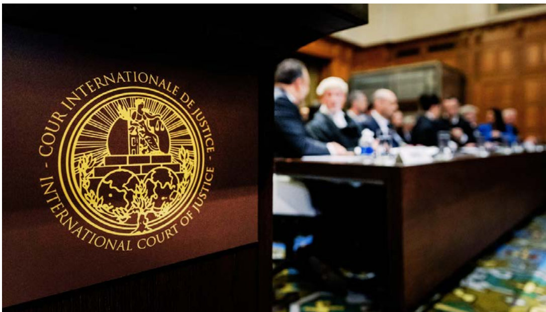
International Court of Justice (ICJ) prior to the hearing of the genocide case against Israel, brought by South Africa, 12 January 2024.